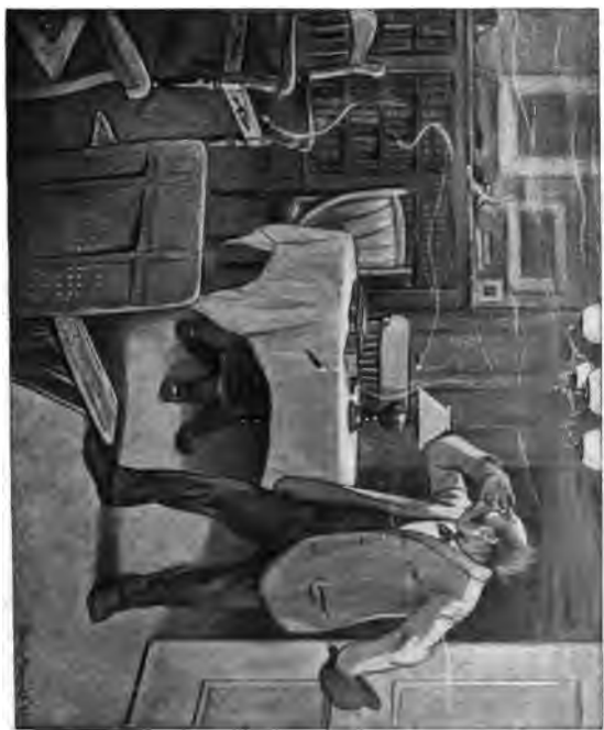
“SIX EMPTY CHAIRS, SORR’”